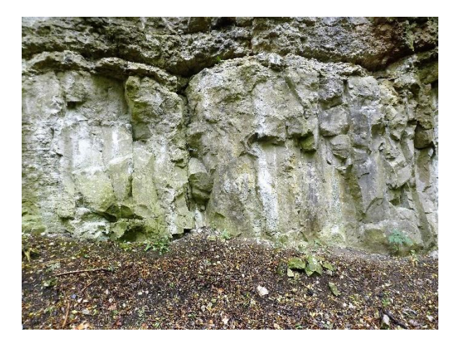
Mud Mounds on the High Peak Trail.

The National Stone Centre (NSC) at Wirksworth also has fringing reefs but these formed a little further into the deeper water of the back-reef lagoon on the platform and are much larger. This site provides an excellent opportunity to examine the reefs, which are not framework reefs, but are created by microbial action and made of lime mud (micrite), flanked by bedded, crystalline limestones (sparite). Large crinoids colonised these reefs and are found close to their growth position or winnowed by currents into parallel deposition. Lagoonal calcarenites have been quarried for building and road stones so at the NSC there is also an opportunity to see the bedded limestones of the platform.