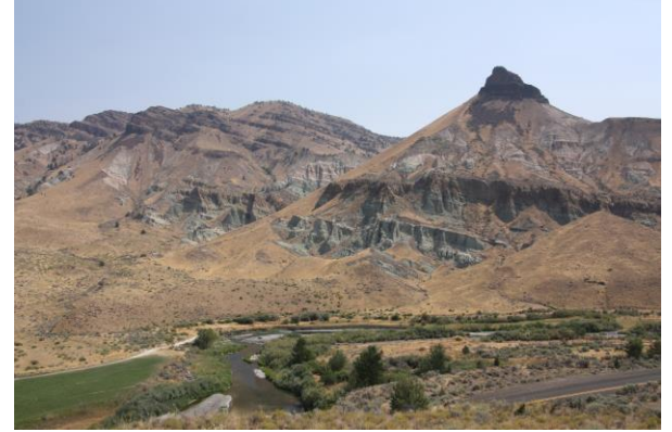
Sheep Rock, John Day Fossil Beds National Monument.

The whistle-stop tour started with lahars, and ash at the John Day Fossil Beds, pointing out an Ignimbrite, 150 feet thick in some places, providing evidence of a catastrophic event at the Crooked River Caldera 80 miles away.