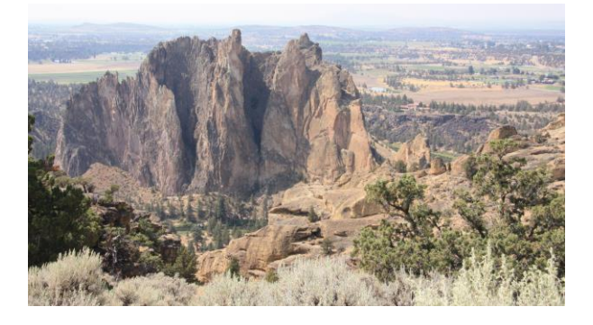
Smith Rock in central Oregon's High Desert near Redmond.

When the Crooked River Caldera collapsed (30 million years ago) into an underground reservoir of magma causing massive eruptions Smith Rock was formed. Ash and debris almost filled the caldera, hardening into rock - the Smiths Rock Tuff.