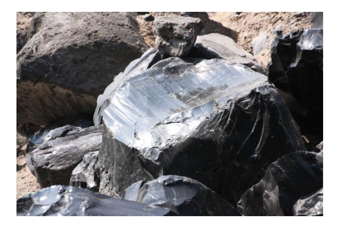
Obsidian at Newberry.

We were then taken to the Newberry Volcanic Monument of 1200 square miles of lava flows, lava tubes, over 400 cinder cones and volcanic vents and the youngest volcanic deposit from the last eruption 1300 years ago – Big Obsidian Flow.